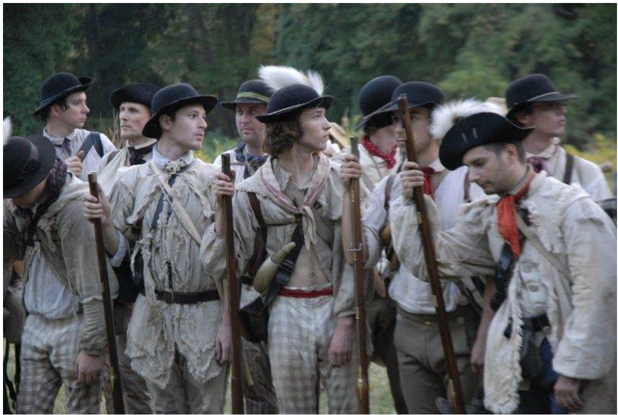
Dunlap's Partisan Corps, 1777