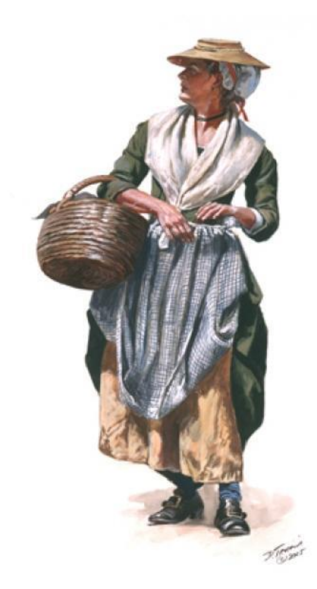
Following the Army, by Don Troiani