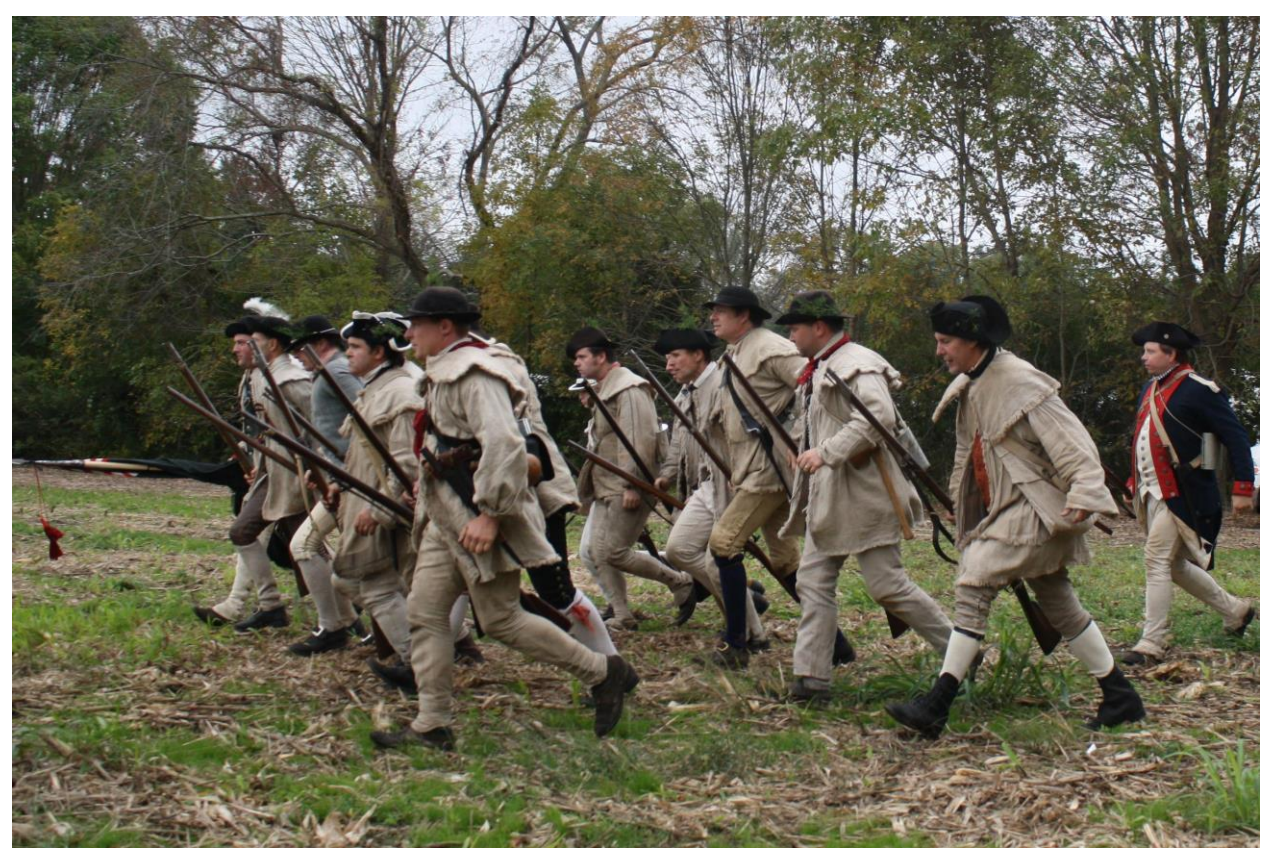
Grenadiers of Virginia, Yorktown Campaign, 1781