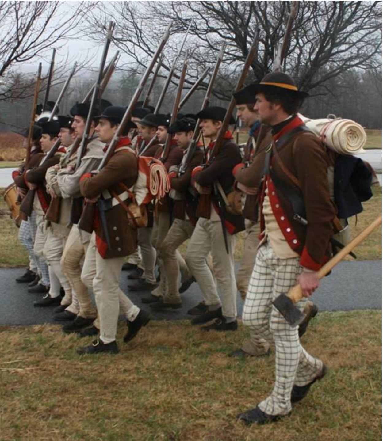
(Above and below) 4<sup>th</sup> Connecticut Regiment, Valley Forge