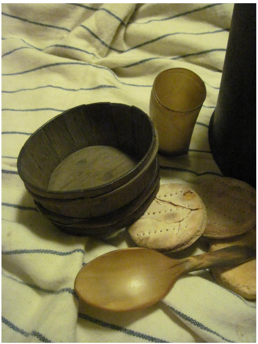
Soldier's mess bowl (original artifact), see article above.

http://www.scribd.com/doc/123562525/%E2%80%9CThe-common-necessaries-of-life-%E2%80%A6%E2%80%9D-A-Revolutionary-Soldier%E2%80%99s-Wooden-Bowl or http://tinyurl.com/at3dj3e