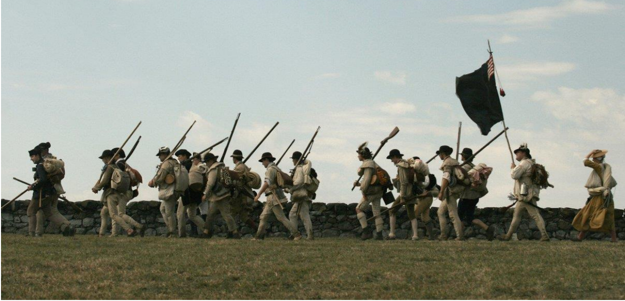
Dunlap's Partisan Corps, 1777