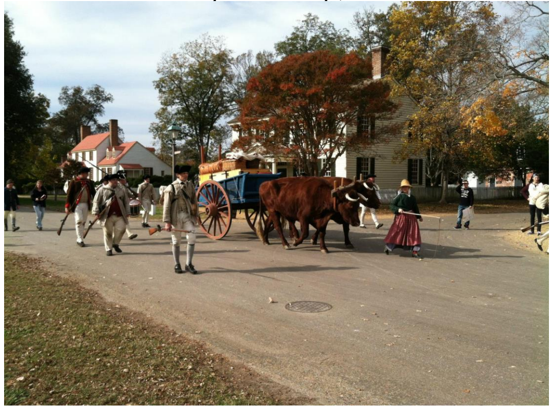
Commander-in-Chief's Guard, Williamsburg, Virginia